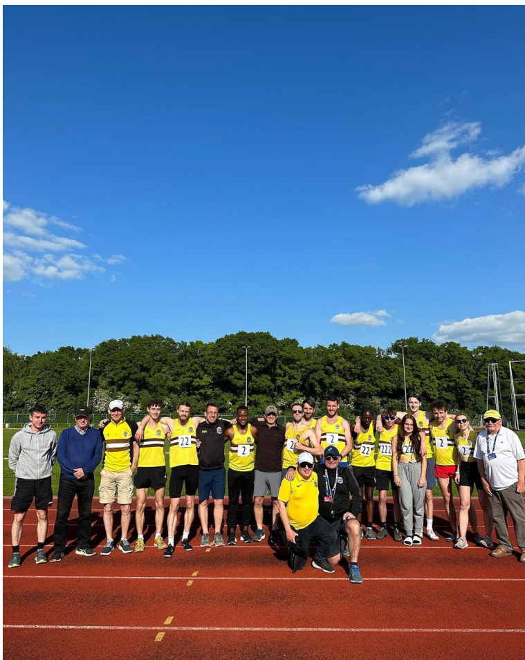
The Midland League track and field team at Worcester

There was a strong start to the Midland Senior Track and Field League season, with Halesowen finishing in third place following the opening meeting at Worcester.